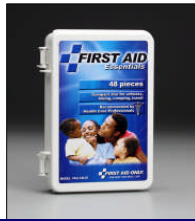
FAO-120- 48 Piece Hard sided First Aid Kit — $9.00