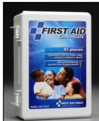
FAO-130-07—81 Piece Essentials First Aid Kit - $12.00