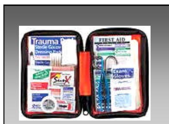
FAO-420- 107 Piece Soft sided Outdoor First Aid Kit — $17.00